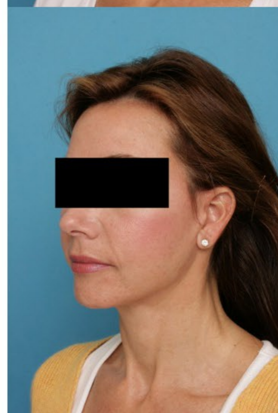
This 42-year old female patient didn't like her sad appearance and wanted a lift with contouring of her face and neck. She is shown before and 1 year after an extended SMAS lift, with autologous fat injected into multiple areas to enhance the contour around the mouth, jawline, and chin.