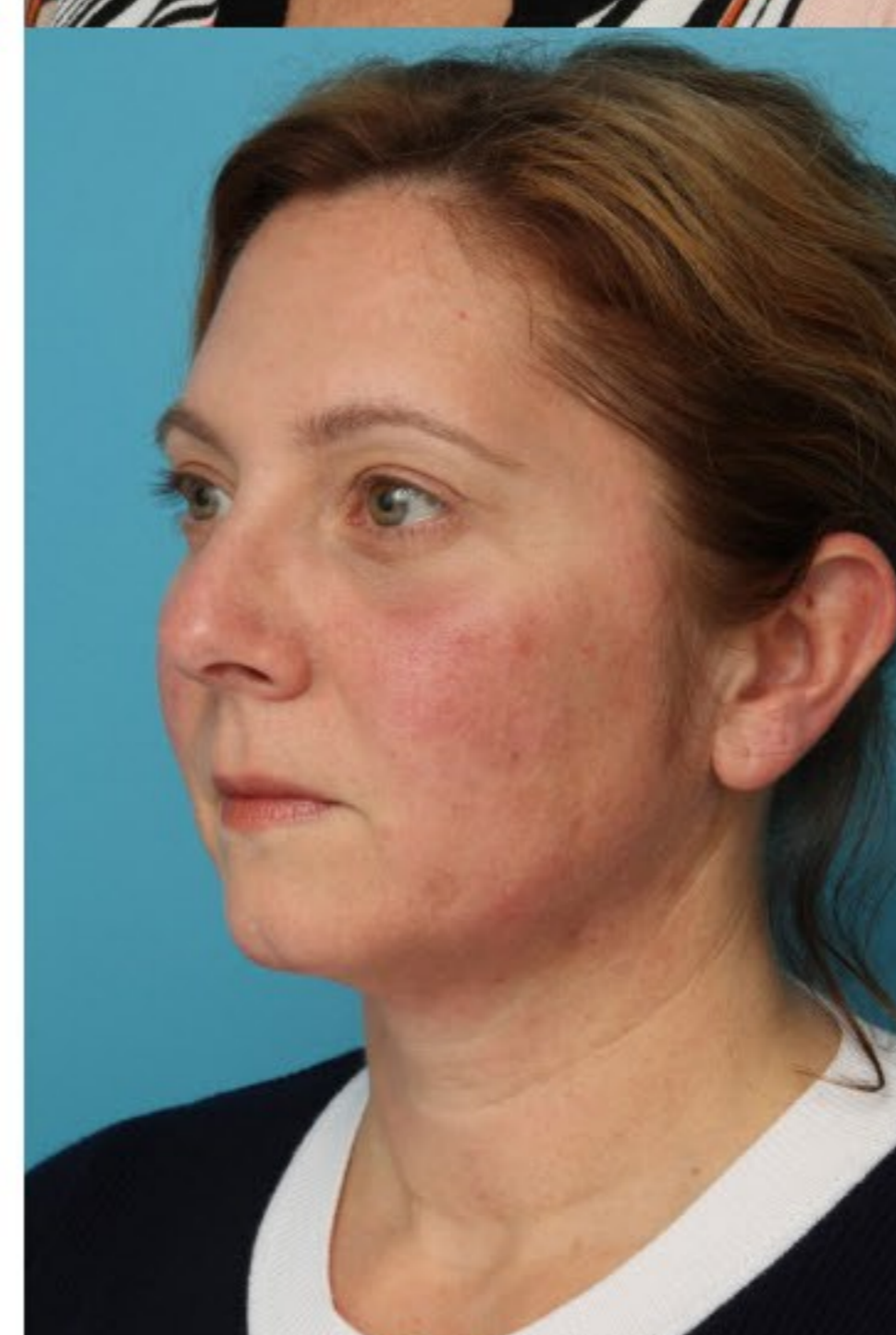
45-Year-old female patient shown before (above) and four days after (below) Instalift and surgical blepharoplasty.